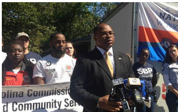
AmeriCorps @AmeriCorps · Apr 5 #CNCNews: @americorps recognized for help w/ @RichlandSC flood recovery. bit.ly/1UUGAct #county4service AmeriCorps, CNCs, RichlandSC and The State Newspaper

Much like when speaking with a reporter, think carefully before you post a message, link, photo or video. Once it’s out there, it’s out there, even if you delete it. Was there a great editorial in your local newspaper on a county issue? Post the link on Facebook to share with your “friends.” Is County Route 12 impassable because of high water? Send out a “status update.” As a county official, be sure to try to drive people to the county website for more information. Keep in mind that the medium is visual. Always consider integrating photos, video and links with each post for maximum engagement.