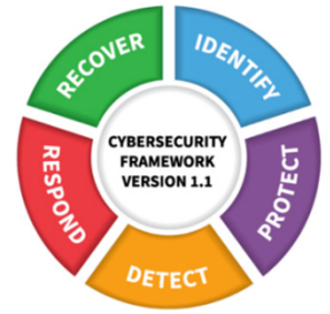
https://www.nist.gov/news-events/news/2018/04/nist-releases-version-1-1-its-popular-cybersecurity-framework

The cybersecurity framework developed by National Institute of Standards and Technology (NIST) is a straightforward way for county leaders to better understand their role in managing cyber risk within their counties. This table presents the NIST framework in both business and nontechnical terms.