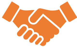
Small Business Assistance