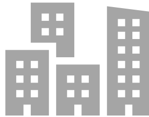
Public Facilities/ Infrastructure